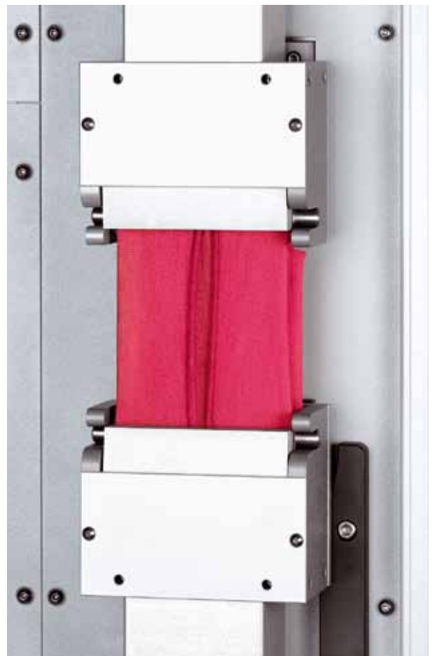
Clamp for knitted fabrics

For testing of the elastic behaviour of woven fabrics containing elastanes pneumatic clamps with special jaw faces are available, too.