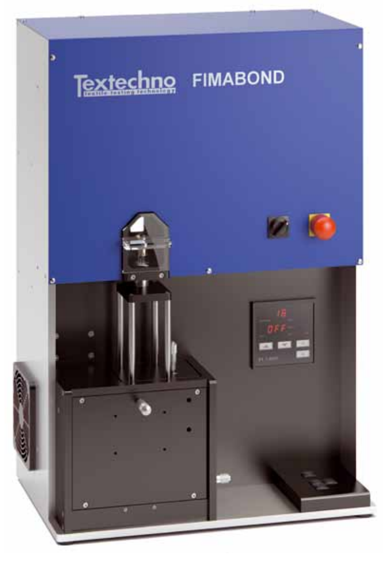
Textechno's new FIMABOND device

which is required to avoid shear forces. For this purpose the fibre has to be embedded exactly in the center of the matrix droplet. The critical adjustment process assuring this will - in the final version of the embedding station - be controlled by an image analyses software developed by FIBRE.